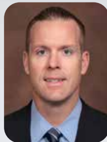
By Matt MacDougall Ladera Ranch Civic Council

Getting involved in your community is one of the most rewarding ways to make a positive impact while fostering connections with others. Whether through volunteering, supporting local businesses, or participating in civic activities, contributing to your community helps build a stronger, more cohesive environment for everyone.